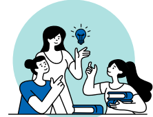
Mentoring with Senior Analyst